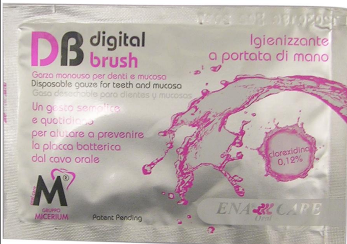
Image of the product